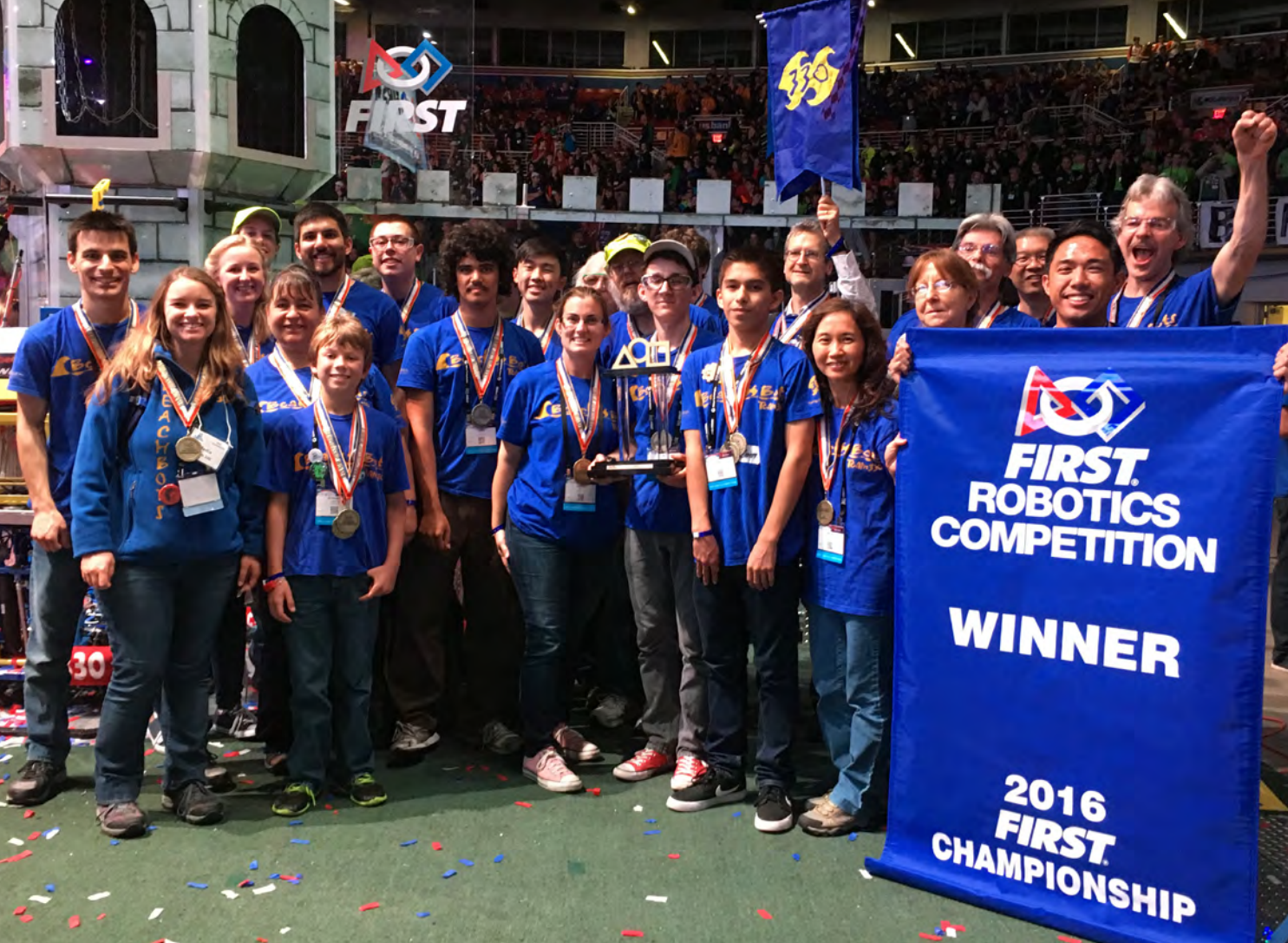
Left: FIRST Team 330 — The Beach Bots — is a Hermosa Beach, California-based robotics team supported by a group of dedicated mentors and funded through a series of Boeing grants that help cover the cost of the team's registration fee and part kits.