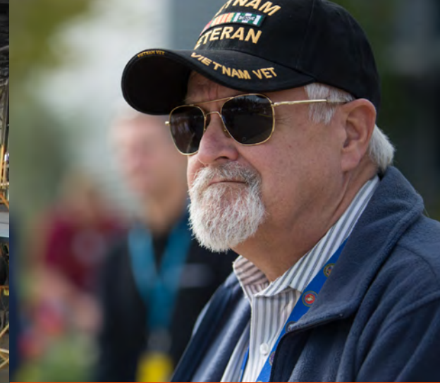
Above: Boeing teammates at the South Carolina site gather for a Veterans Day 2016 commemoration ceremony.