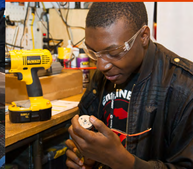
Below: A FIRST participant makes system adjustments to his robot prior to competition. Participation with FIRST allows high school students the unique opportunity to learn science, engineering, computer programming, computer graphics, marketing, business management and many other career-oriented skills in a hands-on environment with real world applications.

“We have seen how (Boeing’s) commitment to innovation, to creative risk taking, to giving every person the chance to do their best runs through everything they do — from designing airplanes to building rockets to hiring the next generation of great computer scientists.”